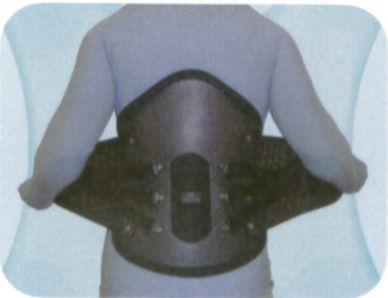
5. Center the posterior panel in the middle of your patient's back.