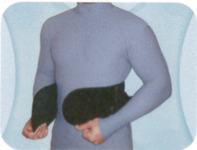
6. Close the front panel low and snug on the patient's abdomen.