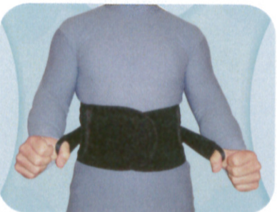
7. Tighten the outside compression straps to the desired level of support, and anchor on the front abdominal panel.