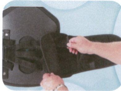
2. Open alligator clamp adjustable panel.