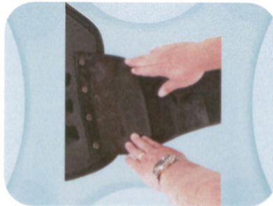
4. Close alligator clamp panel.