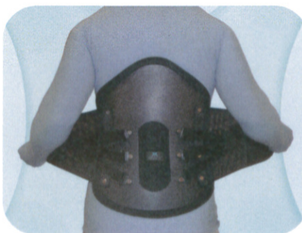
2. Center the posterior panel in the middle of your patient's back.