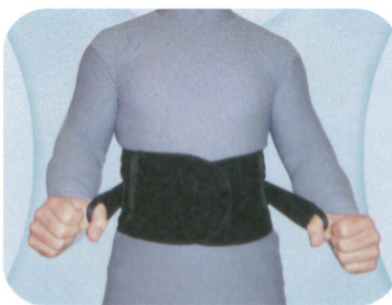
4. Tighten the outside compression straps to the desired level of support, and anchor on the front abdominal panel.